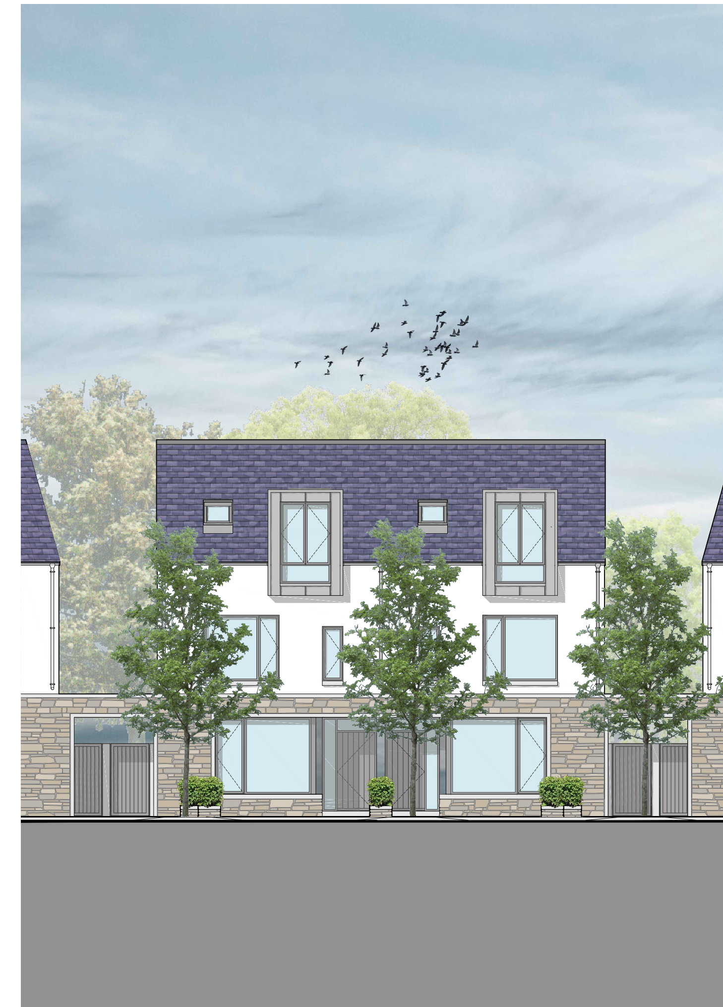
HOUSE TYPES E - FRONT ELEVATION SCALE 1:100